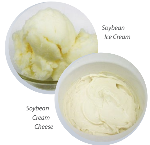
Soybean Ice Cream

To create cheese, tofu was made from the extracted soy milk, and oil, pectin, gums and salt were added to create a cream cheese-like product. The additions of herb, lemon or cucumber flavours hid the beany taste. Producing a hard cheese-like soy product was trickier and required